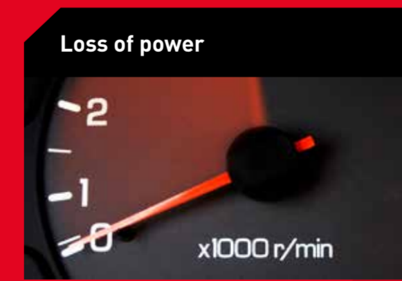
Loss of power

Possible cause: Foreign material entering via air intake Solution: Replace oil and air filters, flush oil galleries