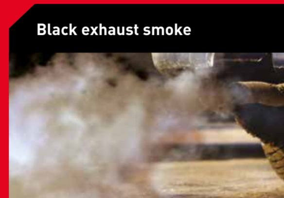
Black exhaust smoke

Possible cause: Dirty air filter Solution: Replace air filter