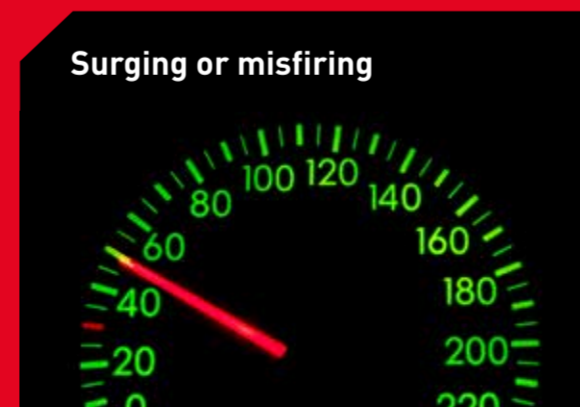
Surging or misfiring

Possible cause: Dirty oil + filter Solution: Replace oil & filter, flush oil galleries