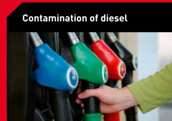
Contamination of diesel

Possible cause: Ingress of dirt via a broken hose, blocked filter or residual debris within the lubrication system Solution: Flush engine to remove any remaining debris and replace oil, air and fuel filters