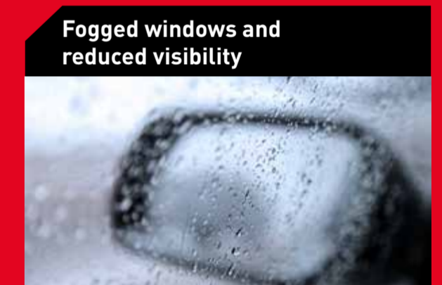
Fogged windows and reduced visibility

Possible cause: Residual debris in oil galleries Solution: Flush oil galleries and replace oil filter, air filter