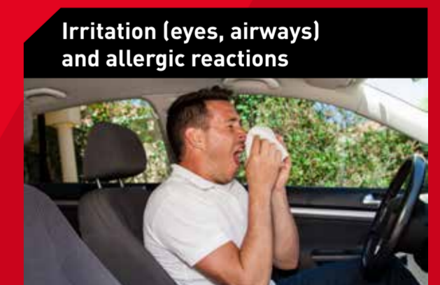
Irritation (eyes, airways) and allergic reactions

Possible cause: • Fuel filter clogged • Dirty air filter Solution: • Replace fuel filter • Replace air filter • Flush oil galleries, replace oil filter