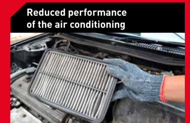
Reduced performance of the air conditioning

Possible cause: Dirty air filter Solution: Replace air filter Flush oil galleries, replace oil filter