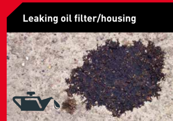
Leaking oil filter/housing

Possible cause: Incorrect fitting Solution: Check fitment or replace fuel filter