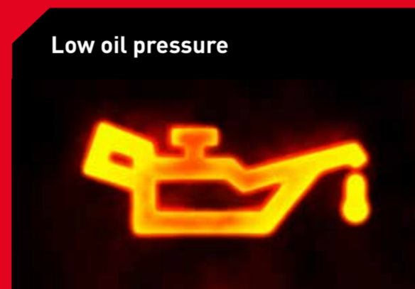
Low oil pressure

Possible cause: A dirty cabin filter reduces the performance of the A/C system Solution: Replace the cabin filter