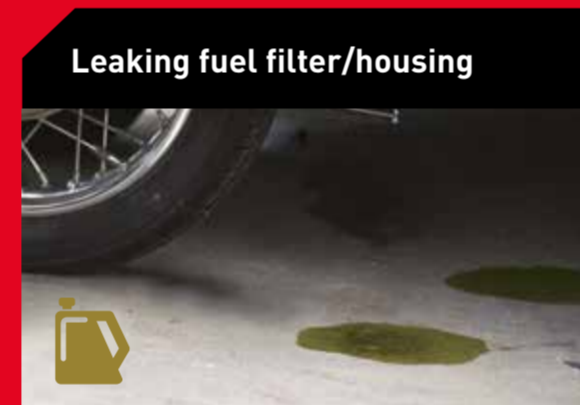
Leaking fuel filter/housing

Possible cause: • Dirty air filter • Water in petrol • Fuel filter clogged Solution: • Replace air filter • Drain fuel tank, replace fuel filter • Replace fuel filter