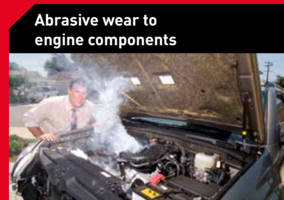
Abrasive wear to engine components

Possible cause: Dirty air filter Solution: Replace air filter